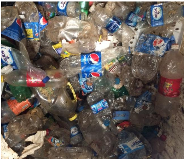
Photo 8: Contaminated PET bottles separated from residual waste