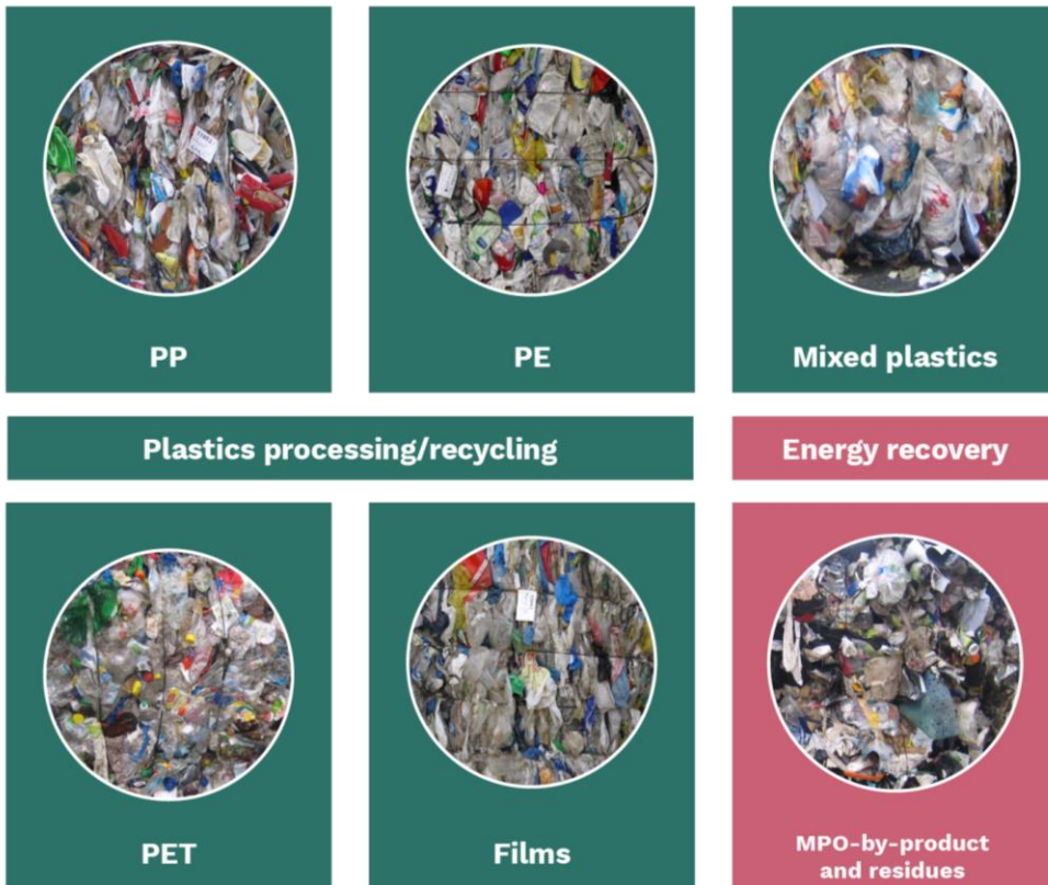
Photo 3: Various sorted plastic fractions (from mixed lightweight packaging collection)