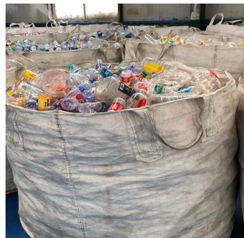
Photo 2: Separate collection of PET bottles, from a project in Beijing, China

Packaging collected in mono-material collections has to be re-sorted prior to recycling to filter out any material that is contaminated or has been wrongly assigned to the collection, as these materials would make the waste less suitable for recycling and reduce its commercial value. Packaging collected as mixed lightweight packaging needs to be sorted into marketable fractions and pressed into transportable bales. The photos in Figure 3 provide an overview of the most important fractions obtained by sorting plastic packaging, which are then delivered to plants for recycling or energy recovery.