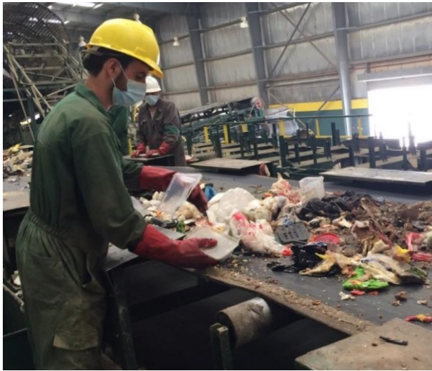
Photo 7: Residual waste being sorted in a pilot plant in Amman, Jordan