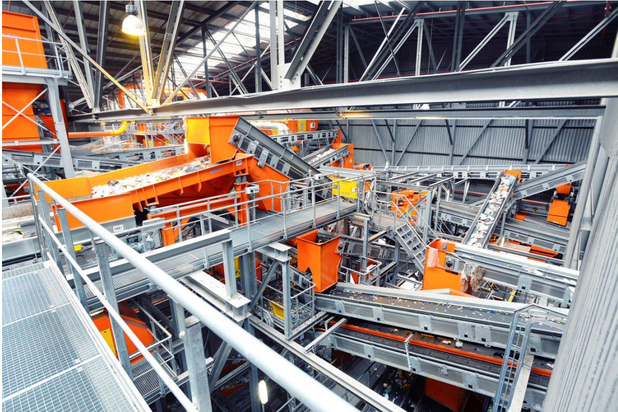
Photo 6: A sorting plant for lightweight packaging in Rotterdam, the Netherlands

different detection tests (e.g. NIR, colour measurement, form recognition and eddy current separation 4 ) from a single machine (known as a multi-sensor separator). This is very useful for separating bottles from trays, for instance.