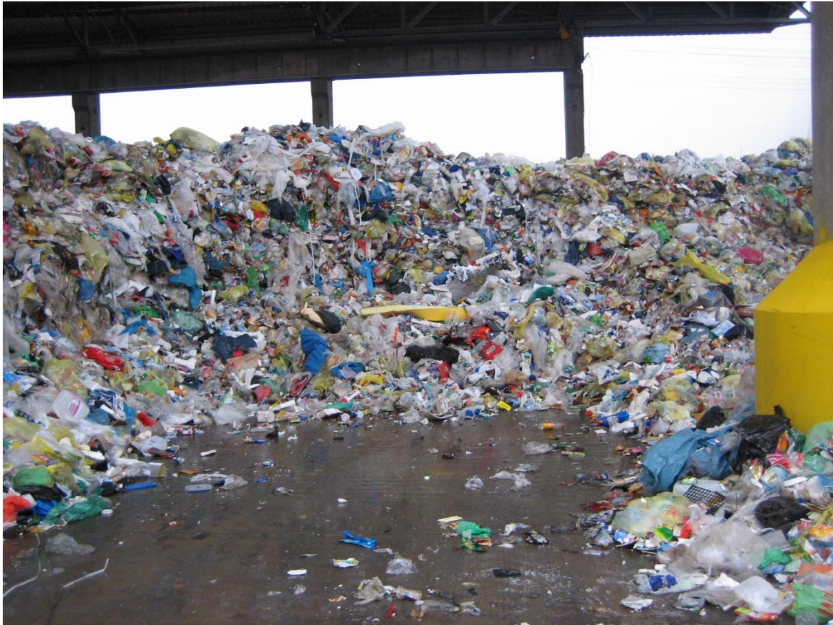
Photo 1: Collecting mixed lightweight packaging in Germany

Sorting collected packaging waste is an essential requirement for mono-material collections (for instance collections of PET bottles only). Before the packaging can be delivered to recycling plants, any residues, contamination and/or impurities must be removed, and the packaging must be sorted by colour to improve the market value.