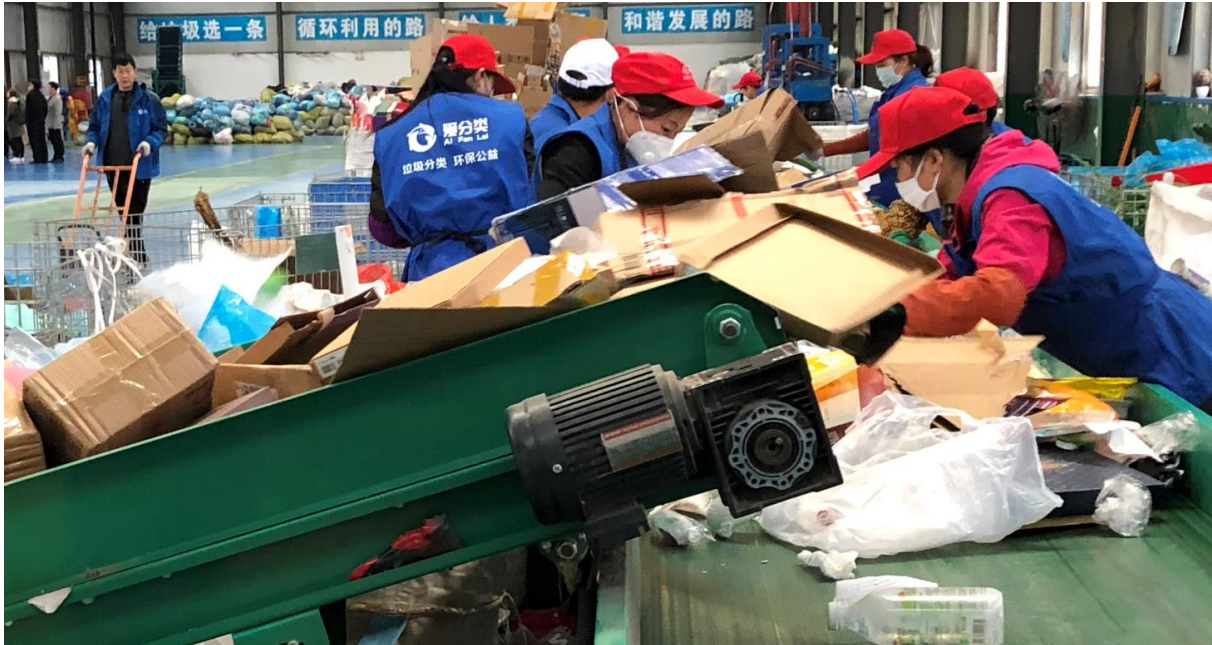
Photo 4: Sorting mixed lightweight packaging manually in Beijing, China