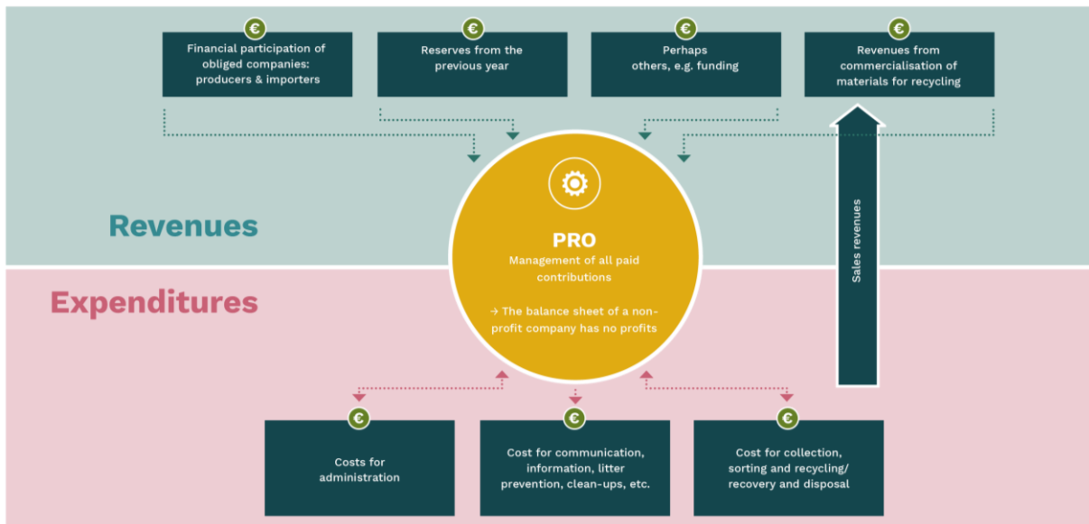
Figure 1: Revenue and expenditure (for a non-profit PRO)

However, both for-profit and non-profit PROs can use surpluses to generate accruals for future waste obligations, or reduce their prices so they can use up their reserves. Some countries put a cap on the size of the reserves a PRO can generate.