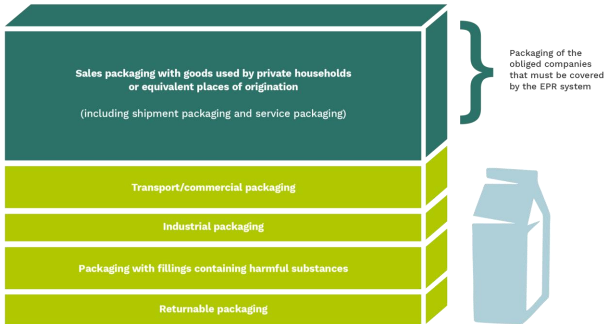
Figure 2: Example of packaging which must be included in the EPR system

The category of packaging known as service packaging represents a special case. Service packaging is defined as any packaging that is not filled with goods until the point at which it is passed to the consumer. Typical examples are bread roll bags, butcher's paper, potato chips boxes, takeaway coffee cups or bags for fruit and vegetables. Specifically in this case, the company marketing and selling the packaging materials – not the coffee – are required to participate in the EPR system and must pay the EPR fees. Companies using and distributing service packaging, such as bakeries or snack bars, in contrast, do not have to pay EPR fees for this service packaging material. However, these companies should obtain evidence from their upstream distributor (the seller of the packaging material) that he or she paid into the EPR system. Proof could be ensured by an invoice, a delivery note or via a contractual agreement. 1