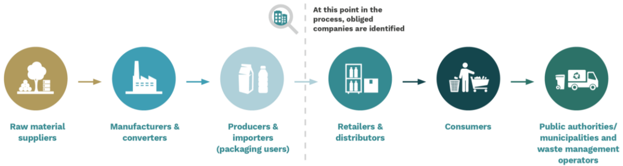
Figure 3: Simplified supply chain and the point at which obliged companies become liable for EPR fees

As a rule, the obliged producer or the obliged importer is the first company to distribute the goods in the country concerned, and is therefore obliged to pay EPR fees. One exception to this rule is service packaging (e.g. plastic bags, food containers), which is only used when the goods it carries are sold. For this type of packaging, the company selling the empty service packaging to retailers, street food outlets, and other places where the packaging will be filled is obliged to participate in the EPR system. Due to the high number of fast food and street food stalls, for instance, it would not be feasible to include them as obliged companies in an EPR system.