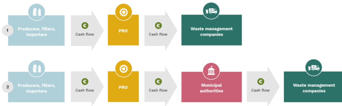
Figure 5: Models for financial flows from PROs to waste management companies

There are a number of other variations that incorporate elements from both models to reflect circumstances in specific countries. Examples include: