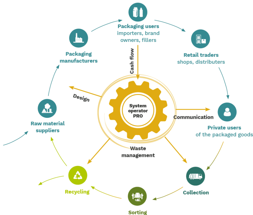
Figure 2: The PRO organises all activity within the system